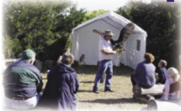
"Birds of Prey" demonstration during National Wildlife Refuge Week in October.

Traveling the Wetlands and Wildlife Scenic Byway brings you face-to-bill with North America's grandest collection of avian species. Stretching some 77 miles from beginning to end, the Wetlands and Wildlife Scenic Byway reveals a natural experience that is second to none.