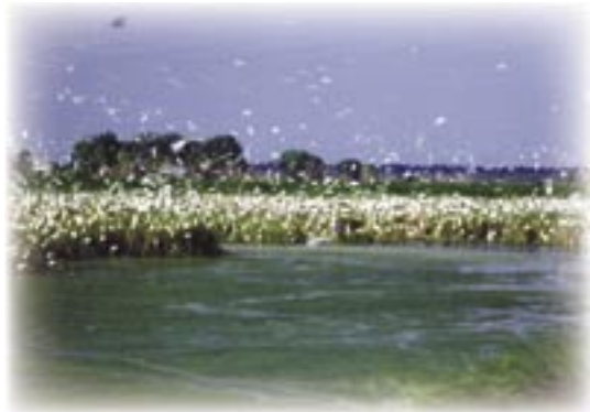
Flock of egrets are common sights.

Quivira National Wildlife Refuge is 22,135 acres of prairie grass, salt marshes, sand dunes, canals, dikes and timber. Little Salt Marsh and Big Salt Marsh are ancient basins that play host to over 500,000 birds during spring migration. The marsh waters teem with crabs, crayfish and frogs while prairie dogs scatter in