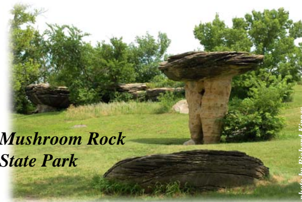
Mushroom Rock State Park

B ison and elk can be enjoyed at Maxwell Wildlife Refuge. The Observation Tower provides a panoramic view of the prairie. Rock mushrooms formed by nature at Mushroom Rock State Park are a unique experience not to be missed. Hike or horseback ride through the Smoky Hills as the Native Americans and early explorers did near present-day Kanopolis Lake Reservoir and State Park. The nearly 25 miles of trails at Kanopolis State Park plus 55 miles around the Park are designated as part of the National Millennium Legacy Trails System. There are 27 historic sites on the driving tour of the Legacy Trails. Bring your fishing pole along to try your luck at McPherson State Lake and Kanopolis State Reservoir. Participate in Mountain Man Days at Maxwell Wildlife Refuge and experience stage coach travel at Goverland Stage Stop.